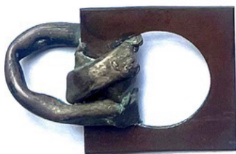
#104 Ring, 2009 Sterling silver, brass NZ $3,675