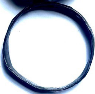
#110 Bangle, 1995 Sterling silver, oxidised NZ $3,000