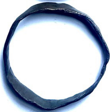
#109 Bangle, 1995 Sterling silver, oxidised NZ 32,000