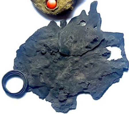
#107 Ring, 2007 Sterling silver, oxidised NZ $4,000