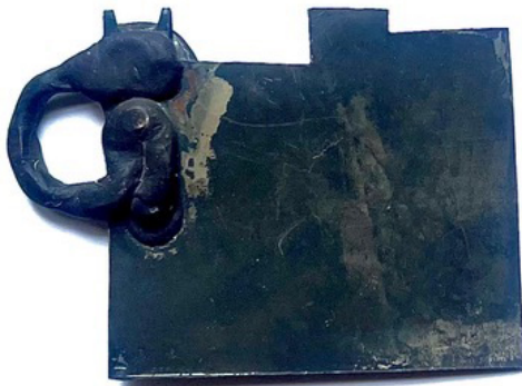
#106 Ring, 2005 Sterling silver, alpakka NZ $4,340