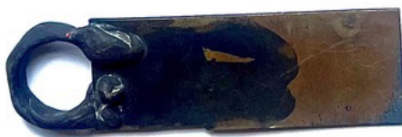
#105 Ring, 2009 Sterling silver, brass NZ $4,000