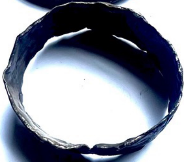
#111 Bangle, 1994 Sterling silver, oxidised NZ $4,675