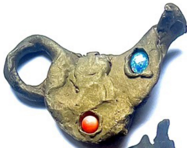
#108 Ring, 2011 Brass, opal, coral, chalcedon NZ $3,000