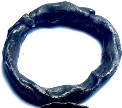
#112 Bangle, 1995 Sterling silver, oxidised NZ $5,000